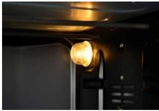
Interior lamp & Non-stick inner surface for easy cleaning